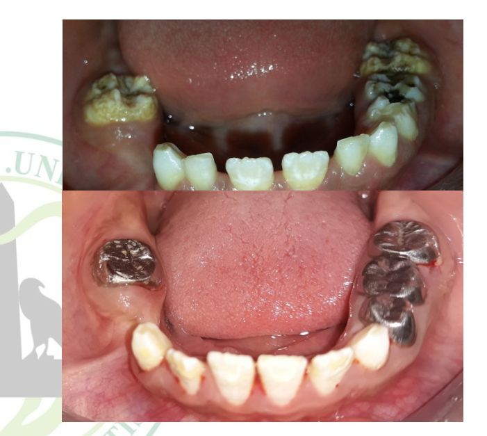
Fig.2 (a) showing a preoperative photo of the hypomoneralized lower first permanent molars (b) Showing the molars after treatment and receiving cast adhesive metal coping (CAC) on 9 months follow up

4- The molar is free from any symptoms of pulp inflammation or has reversible pulpitis (Provoked pain).