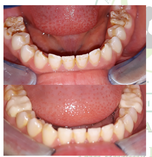
Fig.1 (a) showing a preoperative photo of the hypomoneralized lower first permanent molars (b) showing the molars after treatment and receiving CAD-CAM milled PMMA crown on 9 months follow up

Group II (n=30): First Permanent molars received cast adhesive metal coping (CAC) using nickel chromium alloy (Fig. 2).