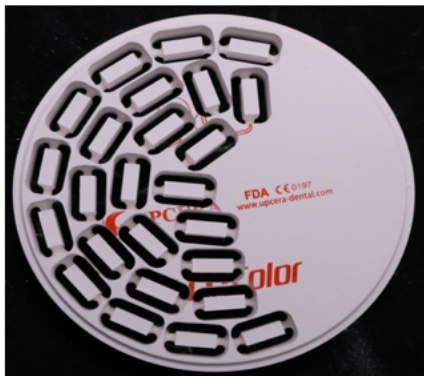
Figure 2: Milled HT zirconia block.

After milling, the samples were thoroughly cleaned with jets of air and then placed in the ultrasonic solution for 1 min and left to dry. The cuboids were then sintered in a ceramic oven (Multimat Easy, Degudent, Dentsply, Hanau, Germany). Each group exactly following their manufacturer's sintering protocol to preserve their physical, mechanical, and optical properties. Cuboids were left to cool down slowly and collected, each group in its dedicated dry clean container.