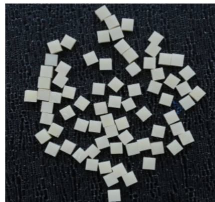
Figure 5: composite cuboids.