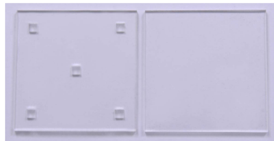
Figure 3: Laser cut 4X4 cubic housing in Plexi-frame.

A 3 mm thickness transparent Plexi-frame was laser cut to form 4X4 cubic housings. (Fig.3) A second Plexi-frame was placed under it to act as a base. Composite resin (Sonicfill, KERR BENELUX, Rue d'Artagnan 28/2, 4600 Visé, Belgique) was injected in 4X4 housing. (Fig.4) A glass microscope slide was positioned on top of the composite to ensure a flat composite surface. Forty composite cuboids were then light-cured for 40 sec. on all surfaces. (32) After curing, the composite was pushed from the housing created. (Fig.5)