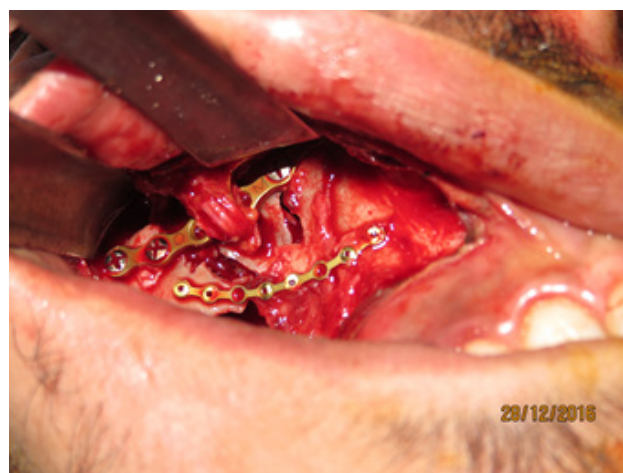
Fig.1: Image showing intraoral approach of fracture line with reduction and fixation of infraorbital rim

Under general anesthesia intraoral approach to access the infraorbital rim was performed through a vestibular incision extending from the midline to the first molar, the mucoperiosteum flap was elevated exposing anterior wall of maxilla, lateral wall of the nose and the piriform aperture to obtain greater motion of the flap. A special attention for the infraorbital nerve preservation as the infraorbital nerve epineurium was dissected to facilitate retraction as well as to tunnelize the infraorbital rim approach above the infraorbital foramen. A part of masseter and zygomaticus major muscles were detached from the inferior border of the zygoma and the zygomatic process of the maxilla exposing the zygomatic body and a part of zygomatic arch. After such exposure it is possible to access the infraorbital rim, to check the reduction in this region. Miniplate was preadapted over the skin then final adaptation was done on the infraorbital rim. Drilling and screw fixation was then performed. (Figure 1)