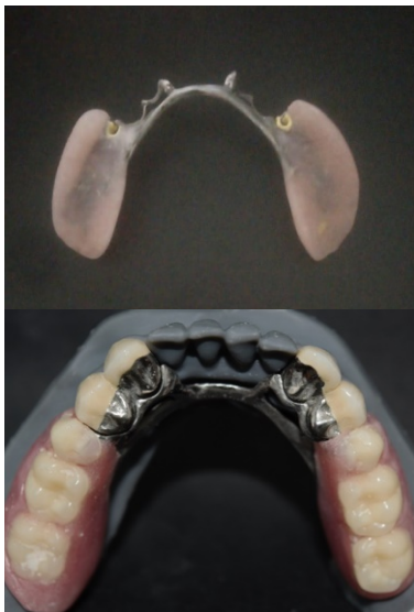
Fig. 5: Finished removable partial denture

A metal framework was waxed and cast then finished and polished. The framework was tried for fitting and the denture was flaked for each experimental model, wax was eliminated, and the heat-cured acrylic resin was packed and cured then finished and polished following conventional techniques (Vertex regular acrylic denture base, vertex-dental, Netherlands). (fig.5)