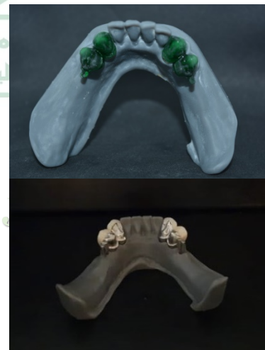
Fig. 3: Computer-assisted designed and milled wax pattern and finished casted crowns and attachments

For group II, the attachment of choice was picked up on software, zirconia (Ceramill Zirconia – Amann Girrbach AG, Koblach, Austria) crowns and attachments were milled (using a five-axis milling machine) (fig.4)