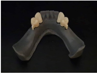
Fig. 4: CAD/CAM designed and milled crowns and attachments