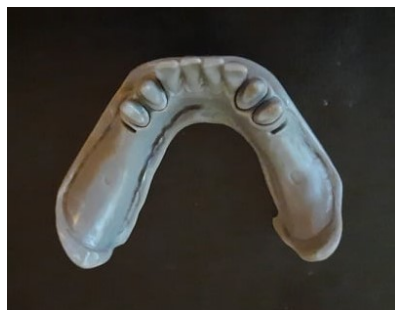
Fig. 2: 3D printed educational cast representing Kennedy class I