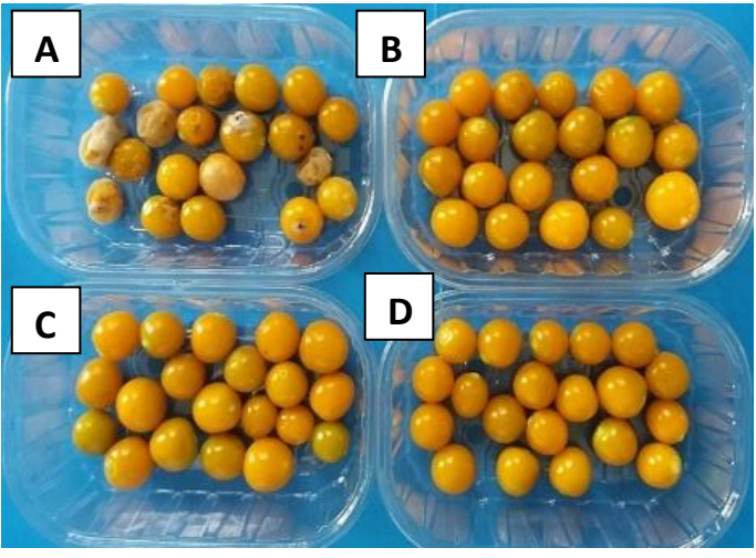
Fig. (3): Effect of Extract plants Moringa (B), Basil (C) and Dodonea (D) control (A) on Decay % during storage period.

bactericidal, pesticides, or fungicidal in nature, conferring plants with antimicrobial properties.