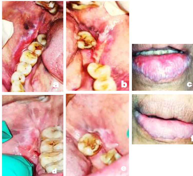
Figure (2): a, b, c: Clinical photograph of a 74 years old female patient showing atrophic OLP on the right side of buccal mucosa, erosive OLP on the left side of buccal mucosa and on the lower vermilion border. (Thongprasome score:4, VAS:8). d, e, f: Clinical photograph of the same patient showing partial healing on the right and left sides of the buccal mucosa and lower labial mucosa. (Thongprasom score:2, VAS:1)