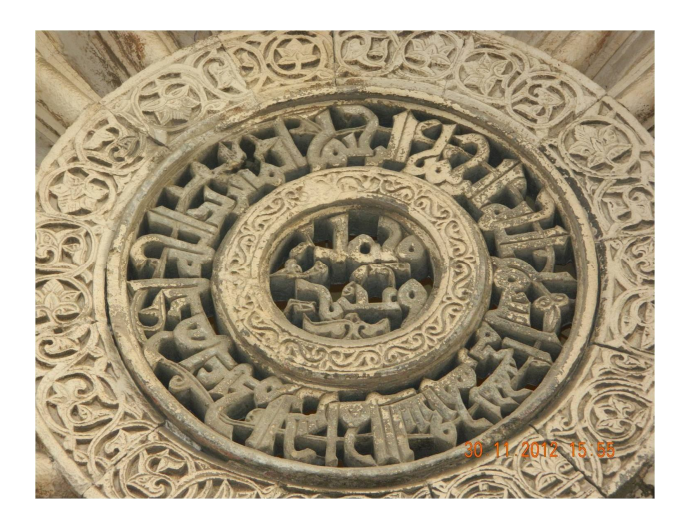
Fig. 2 (by author)