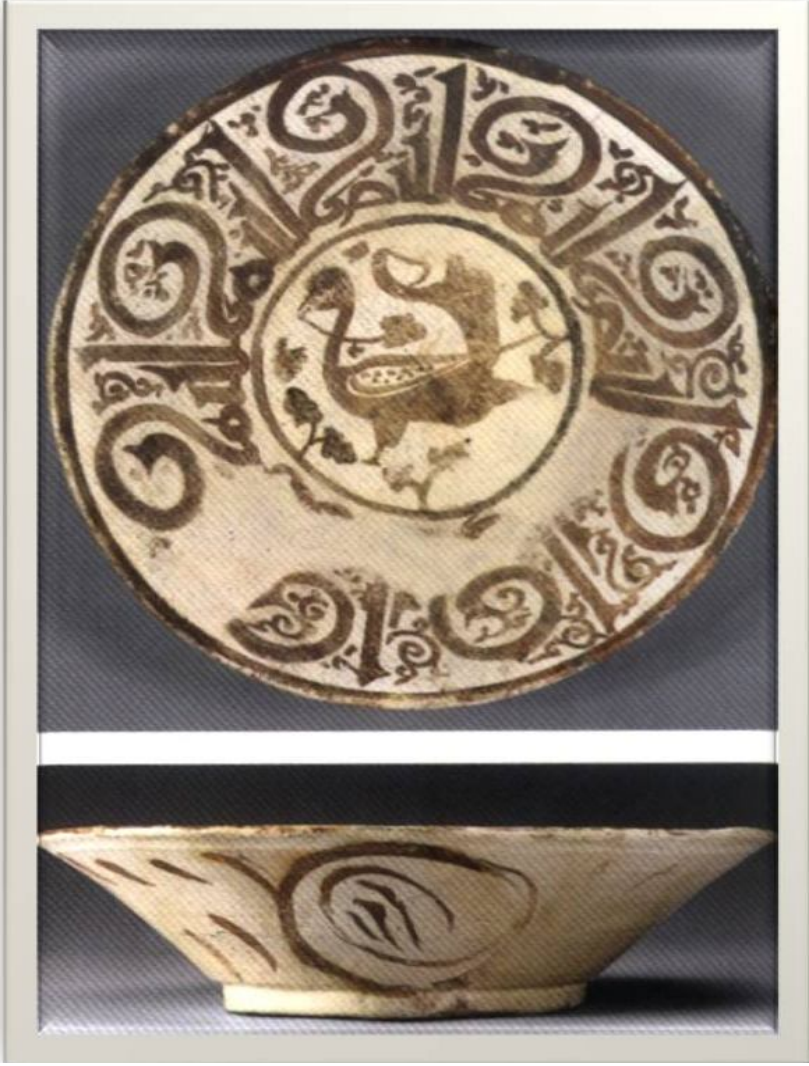
Fig. 3 (by Oliver Watson)

The rabbit was one of the predominant animal motifs in the Fatimid art. The museum of Islamic arts in Cairo and Kuwait national museum display a wide variety of Fatimid pottery decorated with the rabbit. The rabbit, as an animal motif, was used during the Coptic era in Egypt as a symbol of the spirit<sup>27</sup>, while in Islamic art it