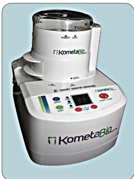
Photograph showing the Smart Dentin Grinder device

Vertical bone level: A line from the apex of the implant parallel to the reference horizontal line of the CBCT was drawn and the marginal bone level was measured from the reference line to the marginal bone crest parallel to the implant.