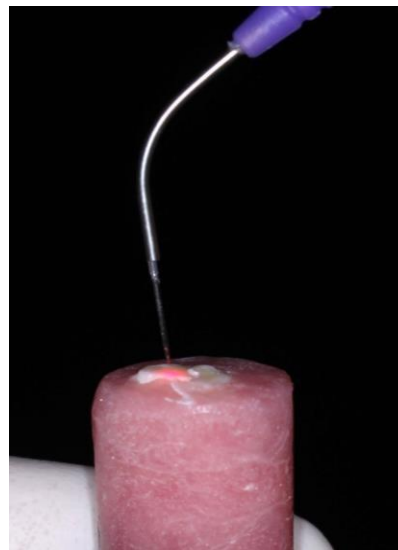
Figure (2): Diode laser irradiation after adhesive application and before light curing.