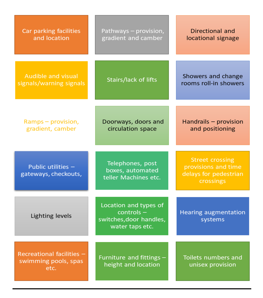
Fig 1 Access requirements in the tourist destination for people with disabilities(PWD) according to