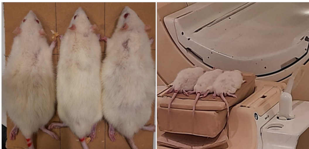
Fig. 1. Rats' preparation and MRI scanning.

To assess the changes that may occur in some immune systems in the blood due to the exposure to the radiation of TE-NORM, some tests that evaluate the change in blood immunity indices have been measured. The investigated indices are white blood cell (WBC) counted, percentage of Lymphocyte (P-LYM), Mean Platelet Volume (MPV), and Platelet count (PLT). After the 60 days of TE-NORM exposure, considered as chronic exposure, the two groups of animals were