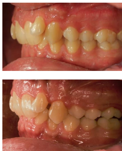
Figure (3): Pre and Post Distalization

The final result after destalization is shown in (Figure 3):