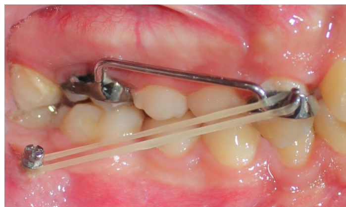
Figure 1: Class II elastics attachment

Raising the bite after dryness by adding glass ionomer on lower first molars occlusal surfaces was done to disocclude the bite.