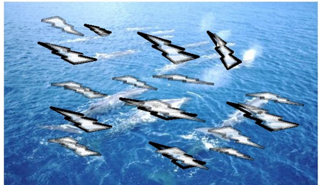
FIGURE 1. The swarm of sperm whales.

For example, pregnant females will assemble with other female whales and calves in order to improve protection abilities. Also, sperm whales are frequently seen in gatherings of somewhere in the range of 15 to 20 population, as shown in figure. 1. The whale sounds are delightful tunes in the sea and their sound range is exceptionally wide. As of not long ago, researchers have found 34 types of whale sounds, for example, whistling, squeaking, moaning, yearning, thundering, chattering, clicking, humming, churring, talking, trumpeting, clapping, etc. These sounds made by whales can frequently be connected to significant capacities, for example, their relocation, encouraging and mating designs. What's more, whales decide food azimuth and keep in contact with one another from an extraordinary separation by the ultrasound which are past the extent of human hearing [2]. system block diagram is represented as in Fig. 1.