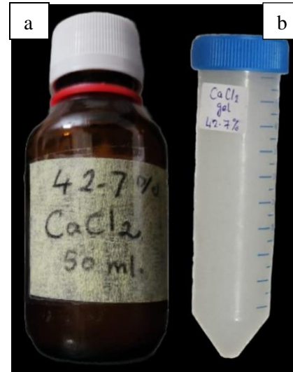
Figure (1): a) \text{CaCl}_2 _Sol. b) \text{CaCl}_2 _Gel.

The surface hardness of the specimens was evaluated at baseline and after pH-cycling. It was determined at baseline using a