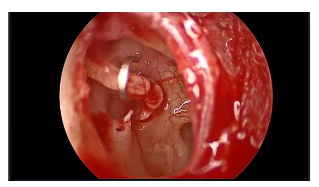
Fig. (3): Insertion of titanium prosthesis and its Fixation by crimping in Group (B)

The median operation time was higher among group (A) than group (B), the distinction was statistically considerable. Total operation time is the period between the application of the endoscope and its removal including the application of the prosthesis and its fixation with bone cement time for bone cement preparation (mixing and insertion)and time of its hardening after application, so it is higher in group A.