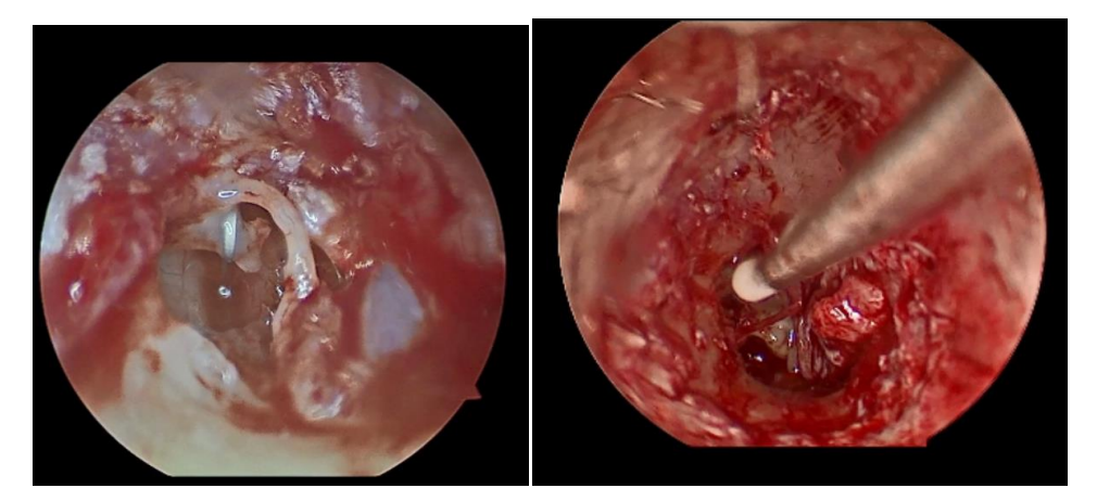
Fig. (2): Fixation of titanium prosthesis with bone cement in Group (A)