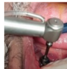
Figure 2 Placement of implant through the guide

After a period of 3 full months, the patients were recalled for the second phase