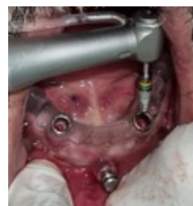
Figure 3 Placement of implant through the guide

First, a tissue punch was used to remove the oral mucosa covering the planned site of the implants through the sleeves of the guide. Sequential drilling protocol and the implants were then mounted on the surgical hand piece and the surgical motor was adjusted to the proper torque of 35 rpm. The implants were then placed until the implant platform was 1 mm below the marginal bone and both implants were placed at the same level. The surgical guide was then removed and a screwdriver was used to place the cover screw over each implant. (Fig.2&3)