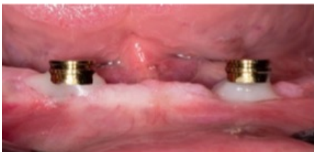
Figure 4 Metal Housings placed with undercut being blocked

The denture's intaglio was then relieved using a metallic bur and a straight hand piece. Once enough space has been created to accommodate the housings, the hard pick-up (Dura Liner Hard chairside Reline, Reliance Dental Manufacturing, Illinois, USA) material was applied to the denture surface and inserted into the patient's mouth. Once the setting time has passed, the denture was removed from the patient's mouth and any remaining excess material was removed and the denture was polished.