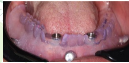
Figure 1 Surgical guide Fixed in place

On the day of the surgery, two bilateral mental nerve block injections were then given to the patient along with bilateral Inferior alveolar nerve block. The guide was then properly seated and the patient was instructed to bite using the upper denture. While the guide was held in place by the patient's occlusion, three fixation pins were used to stabilize the guide. (Fig.1)