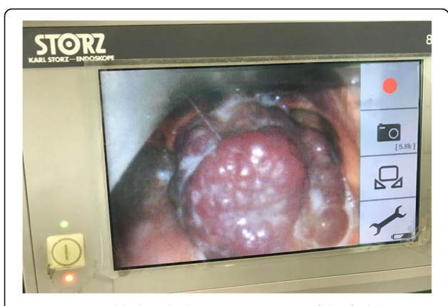
Fig. 1 C Mac D-blade videolaryngoscopic view of the friable hemangioma and glottis.

tumor pushed down by a suction catheter, the neck flexed by an assistant, and the trachea intubated. The stylet was withdrawn, and endotracheal placement capnographically confirmed. The deep and superficial cuffs were inflated with 2 ml saline and 3 ml methylene blue, respectively. Eyes were taped shut, and protective wet gauze and laser-proof goggles applied. Intravenous fentanyl (70 \mu g), propofol (60 mg), and atracurium (30 mg)