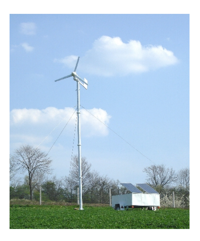
Figure (1): Mobile hybrid power supply (1 kW installed power)