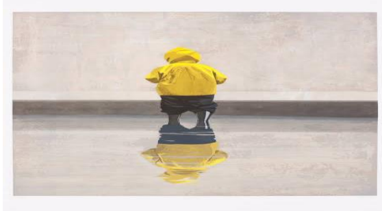
Fig. 2. Tim Eitel, Reflections , 2010

(Eshelman 215). Eshelman traces this feature in the works of Tim Eitel, whose paintings depict people with their backs turned away, or facing the horizon. Because of Eitel's use of flat, rich expanses of monochrome paint in his depictions of nature, his pictures take on an abstract quality despite their apparent realism (Eshelman 221). Eitel's painting Reflections (2010) is a typical example of the performatist concept of opacity (see Fig. 2), with its depiction of a human subject caught up in an aesthetically simplified space, and whose emotional state remains opaque and enigmatic. Eitel's paintings radiate an enigmatic combination of the theist and the human, luring the observer into their space. Such ontological representation radically reverses the values of postmodernism; we are no longer dealing with an anti-image demonstrating the failure of the visual sign to represent reality, but with "a unique, original construct that reshapes the apprehension of reality in a 'divine' aesthetic way" (Eshelman 215).