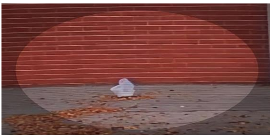
Fig. 1. "The flying bag scene," Alan Ball, American Beauty , 1999

ostensivity as a monist concept of sign. In terms of semiotic theory, performatism draws heavily on Eric Gans's generative anthropology, and the notion of the ostensive sign, developed in the early 1980s. Gans treats the ostensive as being universal, while Eshelman treats it as the semiotic key to explaining the coming epoch (Eshelman xiii). Ostensivity means that in order to defer the violence in a situation of hypothetical conflict between two subjects, they intuitively agree on a present sign that "marks, deifies, and beautifies its own violence-deferring performance" (Eshelman 36). Because of its violence-deferring power, the ostensive sign acquires a supernatural quality; its creator ascribes to it "a transcendent origin" (Eshelman 6). The ostensive sign has no meaning on its own, and its main performative function is to postpone the imminent, potentially deadly conflict and to project transcendent qualities onto the sign. To demonstrate, the ostensive scene from Alan Ball's American Beauty (1999) centers around a white plastic bag (see Fig. 1), in which the protagonist sees an embodiment of the divine. The performatist work attributes to the flying bag a transcendental dimension that readers are forced to identify with, or else they will 'expose' the work on "a dispassionate level, and miss the aesthetic mixture of pleasure and anguish derived from identifying with central characters and scenes" (Eshelman 7).