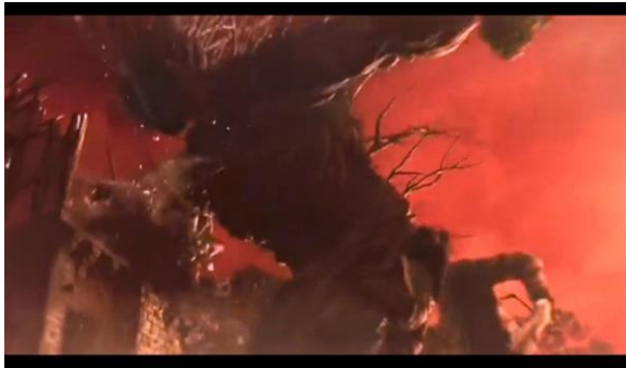
Fig. 4. "Conor within the realm of the apothecary story," Juan Antonio Bayona, A Monster Calls , 2016.

the boundaries between reality and imagination, stating that Conor becomes powerful and visible "through the joint destruction when he and the monster act as a cooperative unit of organisms" (Jorgensen 4). Hence, as Eshelman puts it, "the work is constructed in such a way that its main argumentative premise shifts back and forth" between the frames provided to create an aesthetic closure (37).