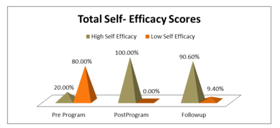
Figure (2): Distribution of the Studied Subjects According to Improvement in Patient Total Self-Efficacy after Program Implementation (No=85).