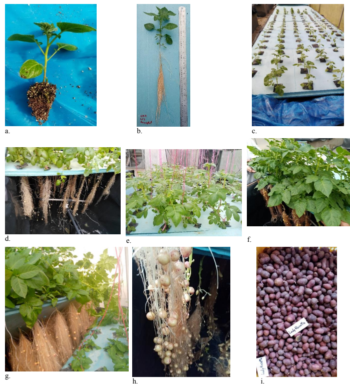
Fig. 2. Mini-tuber production in aeroponics [a: transplants ready for transplanting; b and c: after one month from transplanting; d.: growth of min-tubers; e and f: after 60 days of supporting the plants with strings; f and g: growth of mini-tubers; h and i: harvested mini-tubers]