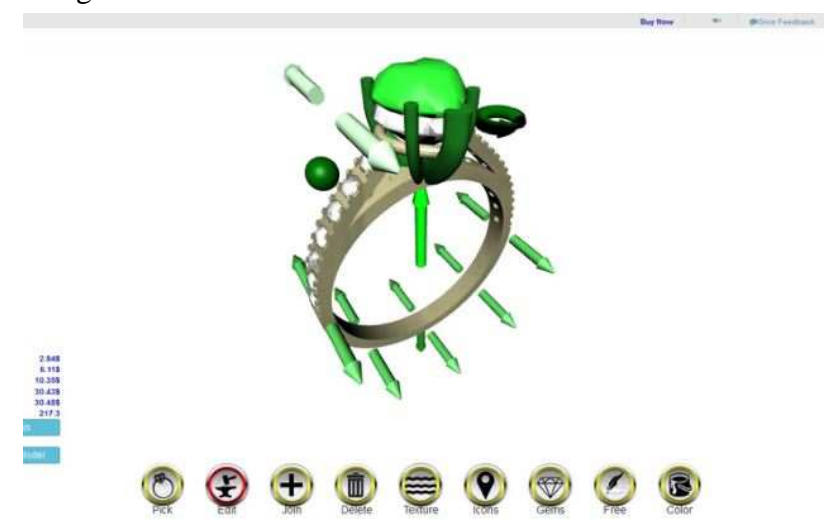
FIGURE 1 ILLUSTRATION OF A RING DESIGN USING WIZEGEM

(Sharma, 2022). An example of a ring designed by using WizeGem is shown in figure 1.