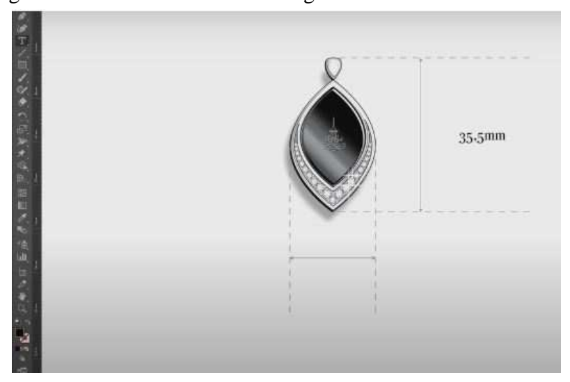
FIGURE 4 ILLUSTRATION OF A PENDANT DESIGNED BY USING ADOBE ILLUSTRATOR

also allows for isometric drawings, three-way diagrams, and customization with a gemstone library (Sharma, 2022). Adobe Illustrator integrates with Creative Cloud apps, allowing users to save their designs to the cloud. Additionally, it is vector-based and flexible for size manipulation according to specific requirements (Sharma, 2022). Illustration of a pendant designed by using Adobe Illustrator is shown in figure 4.