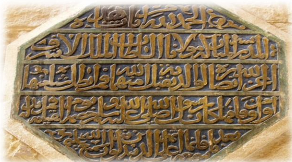
Pl.5.): Cairo, Bab Al-Wazir Street - Al-Tabbaneh - The Bahari Mameluke period, inscriptions on Octagonal marble slab of foundational text of the madrassa, high relief in thuluth script, in Arabic, 770 A.H / 1368A.D.