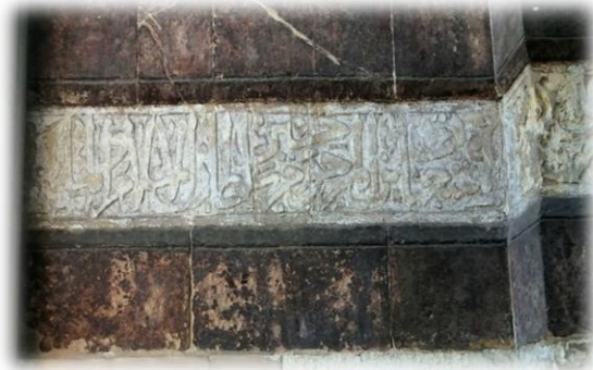
Pl.4.Cairo, Bab Al-Wazir Street - Al-Tabbaneh - The Bahari Mameluke period, inscriptions both sides the main entrance of the Madrassa of Umm Al Sultan Shaaban, high relief in thuluth script of Qur'anic verses and foundational text, in Arabic, 770 A.H / 1368A.D.