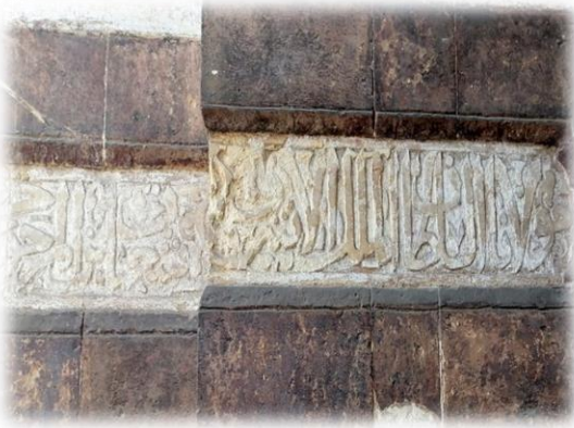
Pl.3,Cairo, Bab Al-Wazir Street - Al-Tabbaneh - The Bahari Mameluke period, inscriptions both sides the main entrance of the Madrassa of Umm Al Sultan Shaaban, high relief in thuluth script of Qur'anic verses and foundational text, in Arabic, 770 A.H / 1368A.D.(Photographed by the researcher)