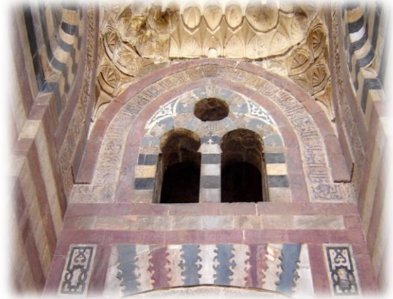
Plate.2,Cairo, Bab Al-Wazir Street - Al-Tabbaneh - The Bahari Mameluke period, inscriptions both sides the main entrance of the Madrasa of Umm Al Sultan Shaaban, high relief in thuluth script of Qur'anic verses and foundational text, in Arabic, 770 A.H / 1368A.D.