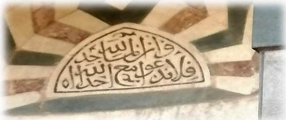
Pl.9,Cairo, Bab Al-Wazir Street - Al-Tabbaneh - The Bahari Mameluke period, inscription on the mihrab cavity of the madrasa, high relief in thuluth script of Qur'anic verses, in Arabic , 770 A.H / 1368A.D.