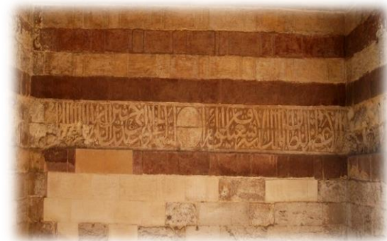
Pl.6, Cairo, Bab Al-Wazir Street - Al-Tabbaneh - The Bahari Mameluke period, inscriptions on Basin for watering animals beside to the Madrassa of Umm Al Sultan Shaaban, high relief in thuluth script of foundational text, in Arabic, 770 A.H / 1368A.D.