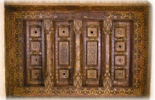
Pl.8,Cairo, Bab Al-Wazir Street - Al-Tabbaneh - The Bahari Mameluke period, inscriptions both sides of the entrance which lead to the Sahn of the madrasa, high relief in thuluth script of Qur'anic verses, in Arabic , 770 A.H / 1368A.D.