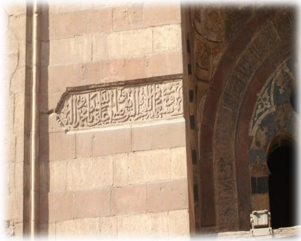
PL (1): Cairo, Bab Al-Wazir Street - Al-Tabbaneh - The Bahari Mameluke period, inscriptions both sides the main entrance of the Madrasa of Umm Al Sultan Shaaban, high relief in thuluth script of Qur'anic verses and foundational text, in Arabic 770 A.H / 1368A.D.

6- Ministry Of Waqfs : Mosques Of Egypt from 21 H 641 to 1365 H .1946 , Reproduced and Printed by The Survey of Egypt –Giza (Orman) 1949, II parts .