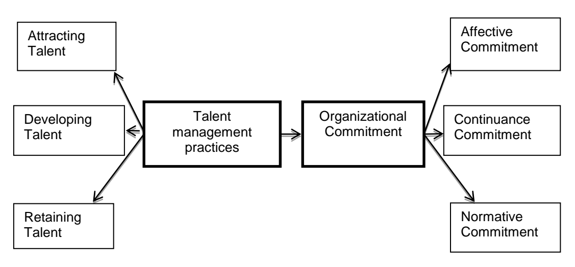
Figure 2: Conceptual model of research

The purpose of this study is to focus on talented employees as the greatest assets, because they make us different in the future. This study differs from other studies as it focuses on the commitment of talented employees of the hotels, that through organizational commitment can achieve all of the above like a competitive advantage, offer the best products and reduce labor turnover.