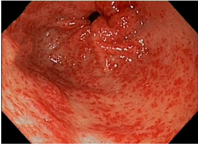
Figure (1): Diffuse type GAVE.

p: p value for comparing between the two groups PHG: portal hypertensive gastropathy