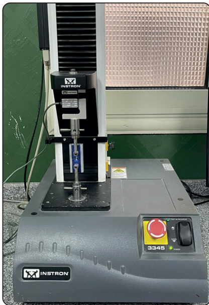
Fig. (4) Beam mounted on universal testing machine

The obtained data of microtensile bond strength was recorded in MegaPascal (MPa) and tabulated. Data were presented as mean and standard deviation (SD) calculated for each group. Numerical data were explored for normality by checking the distribution of data and using tests of normality (Kolmogorov-Smirnov and Shapiro-Wilk tests). The data was found to be normally distributed. One-way ANOVA test was used to compare between different groups. Bonferroni's post-hoc test was used for pair-wise comparisons when ANOVA test is significant. The significance level was set at P \leq 0.05 . Statistical analysis was performed with IBM SPSS Statistics for Windows.