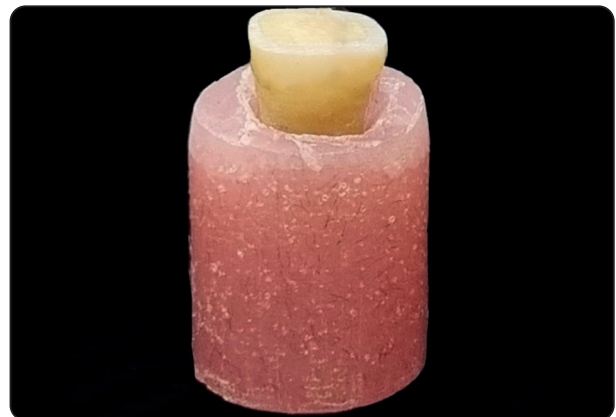
Fig. (2): Tooth after flattening exposing deep dentin.