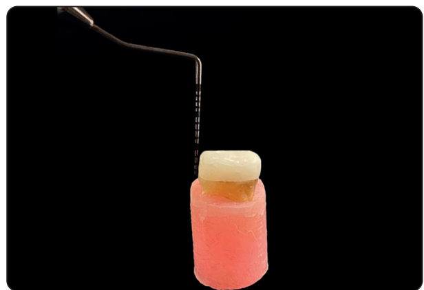
Fig. (3) Confirming 4mm resin composite thickness using a graduated periodontal probe.

mm of bulk-fill flowable resin composite then light cured for 20 seconds followed by 2 mm of packable bulk-fill nanohybrid resin composite and light cured for 20 seconds. After curing, each tooth was mounted on the cutting machine.