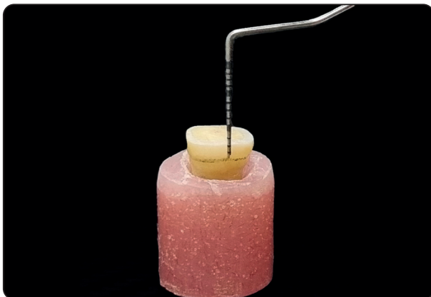
Fig. (1): Deep dentin level determination; 2 mm from the flattened occlusal surface confirmed with a graduated periodontal probe.

Teeth were randomly divided into five equal groups ( n=9 ), one control group and four experimental groups. In control group (Group 1): Admira Fusion X-tra resin composite was applied directly after bonding procedures to etched deep dentin. In experimental groups, teeth were divided according to deproteinizing method and the applied restorative protocol. Group 2: was deproteinized by 10% sodium hypochlorite solution followed by application of Admira Fusion X-tra resin composite. Group 3: was deproteinized by 10% sodium hypochlorite solution followed by X-tra base resin composite liner before applying Admira Fusion X-tra resin composite. Group 4: was deproteinized by 10% bromelain enzyme followed by application of Admira Fusion X-tra resin composite. Group 5: was deproteinized by 10% bromelain enzyme followed by X-tra base resin composite liner before applying Admira Fusion X-tra resin composite. The used materials, their composition and manufacture are listed in Table (1).