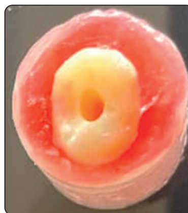
Fig. (1B): Conservative access cavity