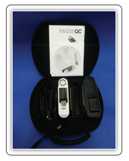
FIG (2) Reflective spectrophotometer.

W stands for a white background, whereas B stands for a black one. Specimens are described by L* values ranging from 0 to 100, respectively. This coordinate represents the material's brightness. The sample becomes brighter as the L* value increases. The a* (ranges from- 90 to 70) and b* (ranges from -80 to 100) values, which define the rednessgreenness and yellowness-blueness respectively. For a*, positive values represent how much of the sample is red, while negative values represent how much of it is green. The b* coordinate is a measure of chroma along the yellow-blue axis. The sample's level of yellowness is represented by positive b* values, while its level of blueness is represented by negative b* values. Data were collected, tabulated and statistically analyzed.