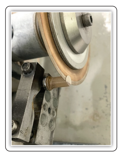
FIG (1) Isomet disc cutting ceramic disc

Japan) was used to check the required thickness after milling.