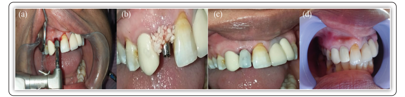
FIG (1) Showing; (A) showing rotary implant insertion; (B) bone graft placement; (C) the provisional restoration in position after cementation; (D) the final restoration after cementation.