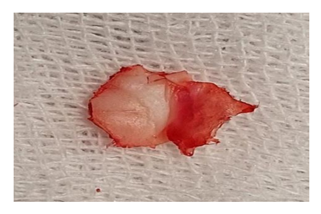
Figure (3): Perichondrium cartilage transplant on one side.