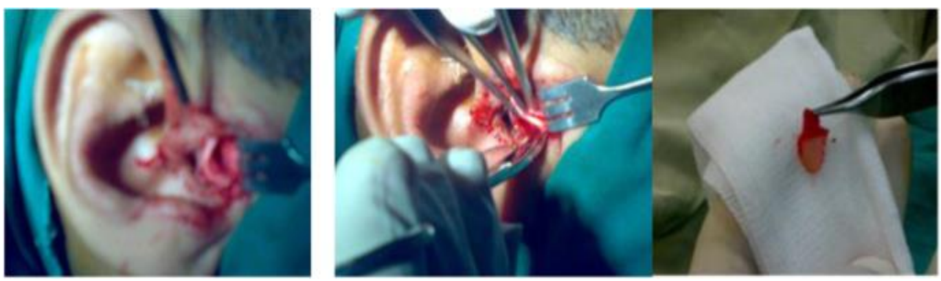
Figure (2): Harvesting tragal cartilage perichondrium graft.