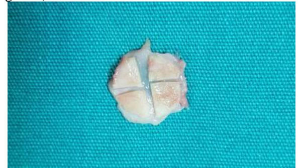
Figure (5): The WSCCG harvested from the tragal cartilage.

Group B: Grafts were extracted from tragal cartilage in the course of the operation. It is composed of sliced cartilages that are 2 mm wide and the complete fold; its length is variable in accordance with the perforation. The only preserved portion of perichondrium was its lateral side. There are cartilaginous island layers on the perichondrium. Wheel-shaped composite cartilageperichondrium graft (WSCCG); graft material in the shape of a wheel composed of four island cartilage units (Figure 5).