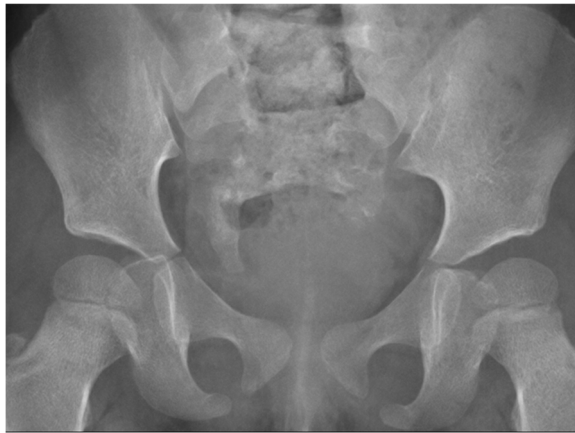
Fig. 3 Radiograph of hemisacrum in Currarino syndrome

Table 1 summarizes the background and perioperative factors of patients with SCT and CS. In both groups, the proportion of female patients was more than two-fold that of male patients. All patients were born at term and had an appropriate weight. Tethered cord syndrome occurred significantly more frequently in the CS group ( p = 0.0108 ). However, no significant differences were observed for other malformations. The size of the tumor evaluated on imaging was not significantly different between the two groups. All patients in the CS group