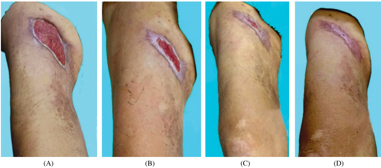
Fig. (3): Diabetic 76-year-old man with raw area in the groin region. (A) Before application of EPBM. (B,C,D) The progress of defect throughout the period of EPBM therapy.