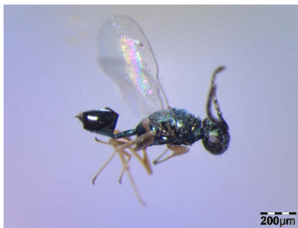
Figure 3. Light microscope of Sphegigaster spp adult male