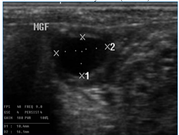
Figure 2. Representative image of mature follicle

In the case of cow #2, all appeared follicles in the scanning at days 19,22, and 26 PP were \leq 5mm in diameter. While follicles with size of 10, 12,13, 15,18 mm were found at day 30,33,36,43 and 50 PP respectively ( Figure 2 ). CL with 15 mm in diameter was detected at day 57 PP and was grown to become 25 mm in diameter at day 64 PP ( Table 2 ).