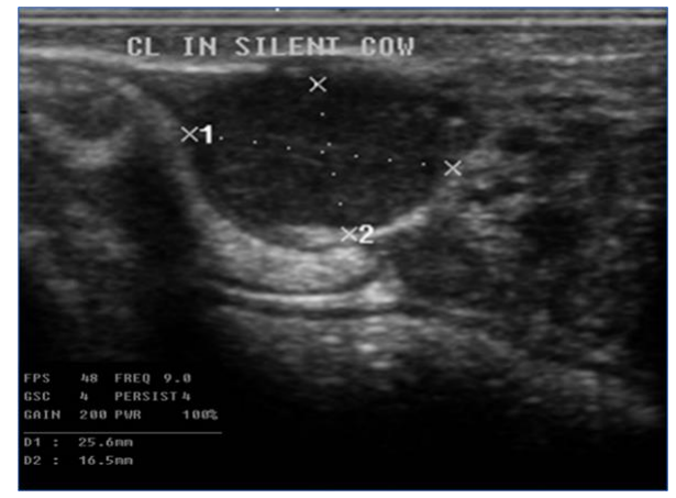
Figure 1. Representative image of mature CL

Results of ovarian ultrasound scanning of cow #1 revealed that 2 large follicles (16 mm in diameter) appeared at day 11 PP and 4 days later (at day 15 PP), 12 mm in diameter CL was observed with one medium follicle and 3 small follicles. The formed CL continued to increase in size from 15 mm at 19 to reach 25 mm in diameter at day 32 PP (Figure 1). No large follicles were observed at day 15 to 29 PP. On day 32, a large follicle was found. The existence of a large follicle with mature CL indicated that the cow has entered the follicular phase of the next cycle. Ovarian structures indicated that the cow was in the luteal phase from day 15 to day 32. Altogether, the observed ovarian structures suggest an early resumption of ovarian activity with induction of ovulation, and CL formation in this cow compared with other scanned cows (Table 1).