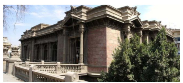
Figure 11, Saeed Haleem Pasha Palace ElNasseria Preparatory School 3.1 Policy Factors: