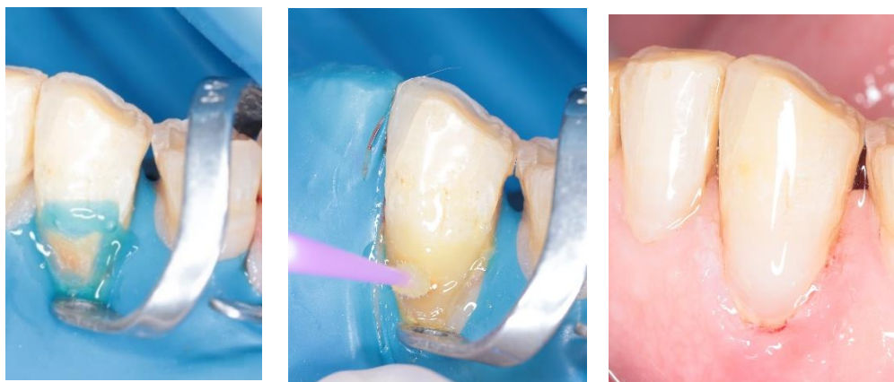
Figure (2): Selective enamel etching, adhesive and resin composite application of intervention group

gel (Pulpdent, Etch-Rite, USA) was applied on all enamel margins for 15 seconds. Rinsing followed by gentle air dryness was performed to remove excess moisture without desiccating the dentin. M-TEG-P universal adhesive (TMR-Aquabond0, YAMAKIN CO., Japan) was placed on a dispensing dish and then applied to the cavity surfaces with a brush. Air-blowing was performed to spread the adhesive into a thinner layer. Afterwards, the adhesive was cured with a light curing unit for ten seconds using LED light intensity 1200 mW/cm 2 (Woodpecker i-LED, Woodpecker Co., Ltd, Guilin, Guangxi, China). Universal nanocomposite (TMR-Z Fill 10, YAMAKIN CO., Japan) restorative material was placed into the prepared cavity in 2mm thick increments and light cured for 20 seconds. After light curing, shape correction was done with fine and extra-fine diamond abrasives, followed by sequential discs for further restoration finishing and polishing ( Figure 2 ).