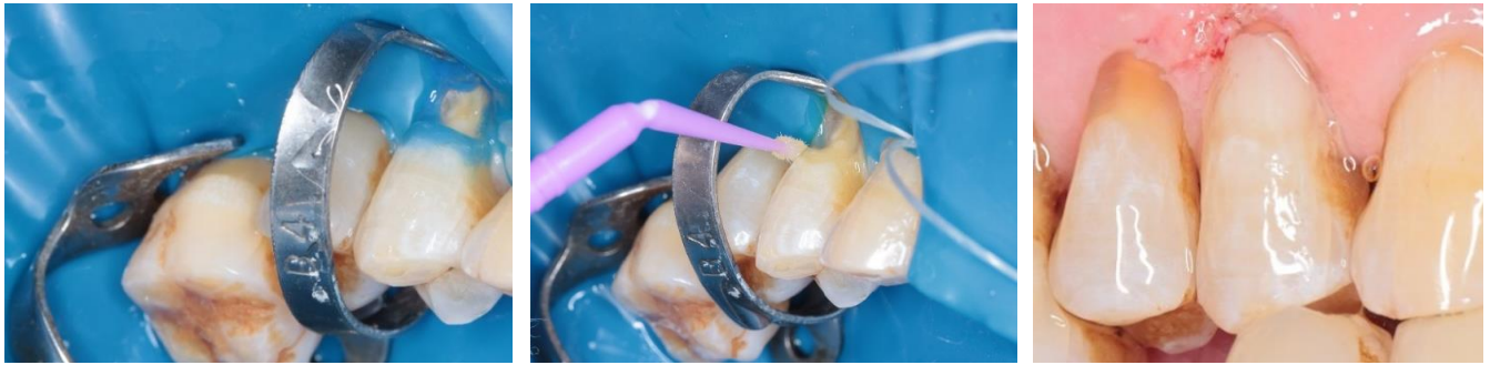
Figure (3): Selective enamel etching, adhesive and resin composite application of control group