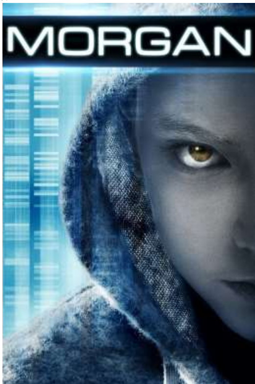
Figure (2): Morgan Trailer made by Watson IBM using AI technologies

larger actions can be reviewed and analyzed effectively. Another major issue with the use of the conventional film methods in VR storytelling is the language of the jump cuts or even the series of shortcuts for focussing the attention of the audience on the crucial characters or even the moments within any scene (Nassar, S, 2021). There are few other areas of the film industry where AI technology can be applied for example promoting movies, casting actors, and many more. In the future generation, AI technology will enable the film industry to perform film making activities more significantly and reduce problems in less time.