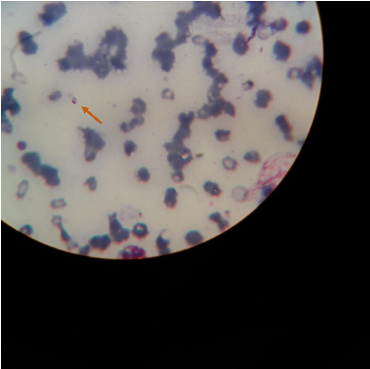
Figure 2: Bone marrow aspirate from same patient showing presence of LD body on relapse episode of fever depicted by red arrow