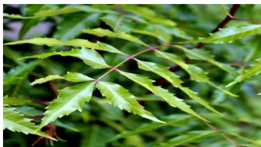
Figure 6: Melia Azadirachta L. Bark (Neem Leaves)

Neem has many therapeutic and germicidal qualities and is non-toxic and biocompatible with humans.[93] Many human ailments, including those with anti-inflammatory, anxiolytic, anti-androgenic, anti-stress, humoral and cell-mediated immune stimulant, anti-hyperglycemic, liver-stimulant, antiviral, antiulcer, antifungal, and anti-malarial properties, have been linked to the majority of the plant's parts, including fruits, seeds, leaves, bark, and roots [94].