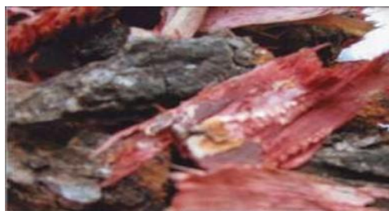
Figure 7: Melia Azadirachta L. Bark (Neem Bark)

The active coloring component tannin, which is used for tanning and dyeing, is what gives neem bark its brown color. The OH groups in the tannin have a strong binding with the fabric's functional locations.[98, 99]