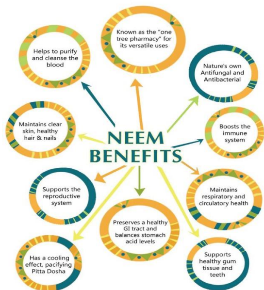
Figure 2: Neem Benefits in all field