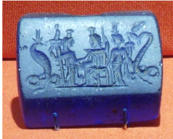
Fig.11. Plaque depicting Thermouthis, Demeter, Serapis, Isis, Agathodaimon, Metropolitan Museum, 1976.52. After; https://www.metmuseum.org/art/collection/search/547872 accessed on 3/6/2021.