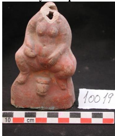
Fig.8. Figurine of a Woman Purifying herself, may be represented Baubo. After; Ibrahim, N., (2020). Two unpublished figurines, p. 645: 664, Fig.1.