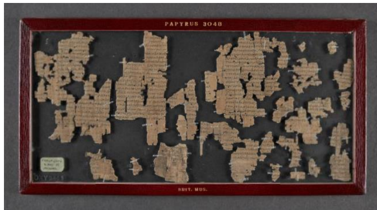
Fig.2. Satyrus, P.Oxy. XXVII, London, British Library Pap 3048 .

Fragmentary columns preserving portions of Satyrus' treatise 'On the demes of Alexandria'. Explanations of the names of tribes and demes are given and directions for a procession in honour of Arsinoe Philadelphus are provided, with instructions about the route and the dignitaries involved and about places where personal sacrifices may be offered.