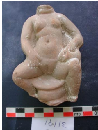
Fig.9. A woman Figurine Purifying herself, may be represented Baubo. After; Ibrahim, N. (2020). Two Unpublished Figurines, p. 645: 664, Fig. 2.