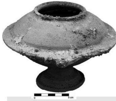
Fig.4. Eleusinian vase, Chatby, Graeco-Roman Museum, no. 15580. After; Mitsopoulou, Chr. (2016). Two Eleusinian Vases from Alexandria , p. 161, pls. 1, 2a-b, fig. 1.

Description 42 The base is large, stepped, sculpted, and open in appearance. The lid is plainly made of dark brown clay, and it has a thick coat of white wash over it, with vestiges of other painted banded artwork that are now hardly visible. It has a high, bell-shaped appearance and is topped by a flat knob. There are triangular incisions on the upper half; the rim is not modelled, and the wall is straight.