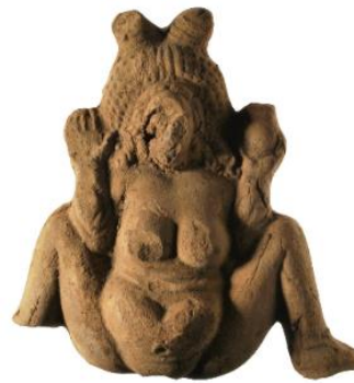
Fig.7. A terracotta statue of goddess Baubo, British Museum, 1. 886,0401.1452.

A woman in a crouching position. Sitting with her legs spread wide. She is covered only by a sleeveless dress with tightly fitting cuffs that, presumably, crossed her shoulders. Both hands are lifted just over her shoulders, the arms are bowed at the elbows, and the left hand is holding a little pot while the right hand is palm outward. It has been suggested that this and similar types have been connection with the Eleusinian mysteries and the story of the goddess Baubo and Demeter. According to the legend of Demeter, Baubo claimed to be a lame servant of King Celeus of Eleusis, observed the grieving goddess and tried to help her with cheering the goddess with raising her skirt, and exposed her body to the goddess Demeter. According to the Iambe story, Iambe was the first Demeter's priestess.