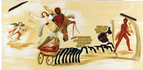
Fig.10. Second room of the house tomb M3, Tuna El-Gebel. The back wall depicts the rape of Persephone. After: Lembke, K. (2014). City of the Dead: The Necropolis of Tuna el-Gebel during the Roman Period. Egypt in the First Millennium AD: Perspectives from New Fieldwork. , British Museum Publications on Egypt and Sudan 2, p. 83, pl. 7.

The funerary house no. M3 57 consists of two chambers. The second chamber in this House tomb dominates a funeral niche. This niche houses a brick-built klinè with a different conception from the one in the House of the Dionysiac Krater. Simple legs are engraved on a structure that is otherwise painted to appear as if it were made of bricks, with dark lines defining the mortar, elaborating on itself and other brick-built banquettes at Tuna el-Gebel in a postmodern manner. Two columns flank the klinè niche, each painted to seem like green, variegated grass. A vaulted roof is supported by marble columns.