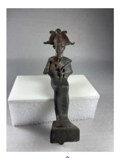
(Fig.12): Seated Statue of Osiris, 26<sup>th</sup> dynasty - Late Period, made of bronze, Brooklyn Museum: No. 37.430E After:https://www.brooklynmuseum.org/opencollection/objects/117082