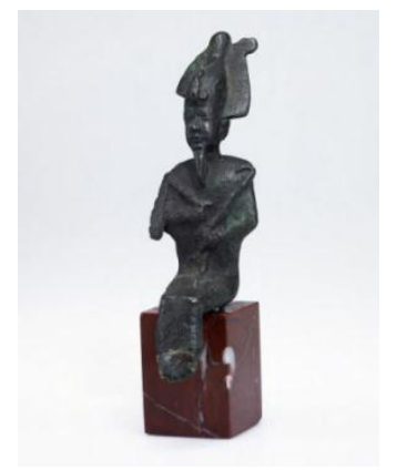
( Fig.11 ): The seated statue of Osiris in the Louvre and and is cataloged as part of the esteemed Harvard Art Museum's collection: No.1919.524.A

After: <a href="https://www.bridgemanimages.com/en-US/noartistknown/schist-statue-of-seated-osiris-from-tomb-of-psamtik-at-saqqara/object/asset/541397">https://www.bridgemanimages.com/en-US/noartistknown/schist-statue-of-seated-osiris-from-tomb-of-psamtik-at-saqqara/object/asset/541397</a>