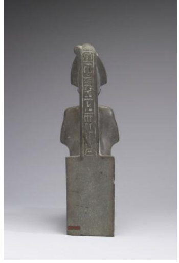
( Fig.7 ): The greywacke seated statue of Osiris, dating back to 26<sup>th</sup> dynasty - Late Period, displayed in the Walters Art Museum: No. 22.207

After: https://art.thewalters.org/detail/21194/osiris-lord-of-the-dead/