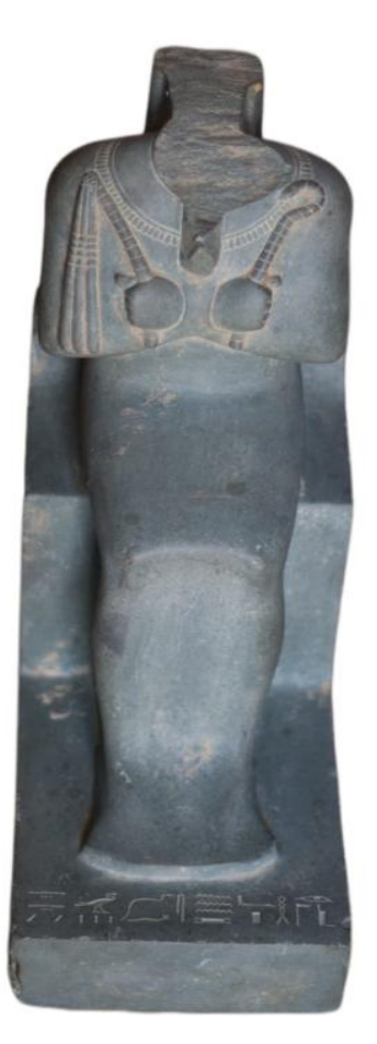
( Fig.1 ): A headless Seated Statue at Ismailia Museum (No. 2597)