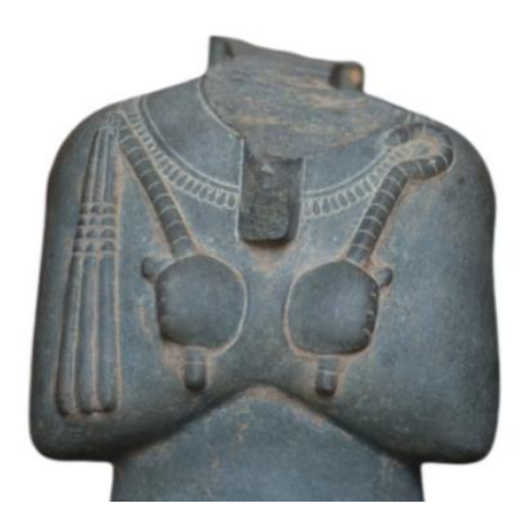
( Fig. 2 ): The Upper part of the statue, the hands is positioned one above the other.