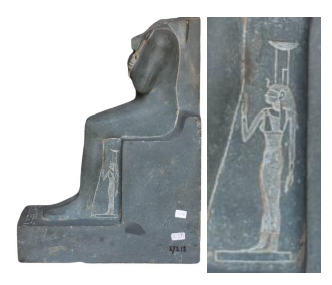
(Fig.4) Nephthys appears on the left side of the statue as protector of Osiris.