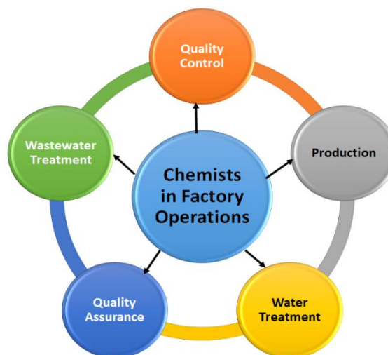
Figure 2. Departments in the sugar factory that require the services of chemists.

The knowledge of different aspects of chemistry is required in different sections of the factory, which makes the services of chemists an essential ingredient for its smooth-running. Examples of such departments are shown in Fig. 2. This section gives an overview of the responsibilities of chemists in the sugar production operation.