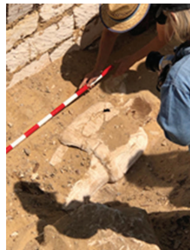
Fig. 5. Detail of the discovery of the individual 36192. Oxyrhynchus Archaeological Mission.

The deceased was found enclosed in a plaster mummy case. The final thin layer featured a complex decorative programme. When it was excavated in the 2020 campaign, its state of preservation was very fragile; for this reason, a block extraction was carried out.