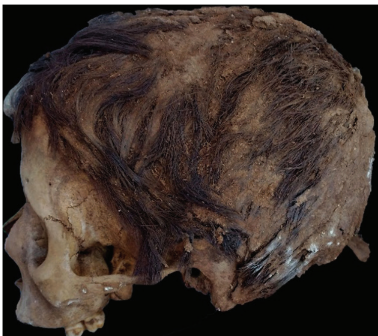
Fig.3. Skull of the child 36192, preserving the hair. Oxyrhynchus Archaeological Mission.

In the treatment of the corpse, ointments were used on the skin and hair, as indicated by the brown coloration and the arrangement of the hair in combs, as well as the dark shades on the bone tissue and especially on the joint surfaces. 5