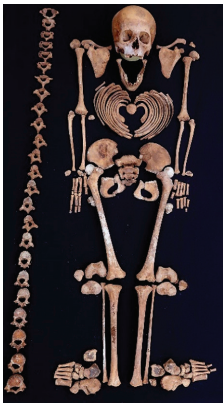
Fig. 4. Skeleton in anatomical position of the individual 36192. Oxyrhynchus Archaeological Mission.

At a pathological level, only the orbital roofs retain the imprint of a deficit period in terms of mineral contributions to the blood, with bilateral cribra orbitalia in an active phase. The hypoplasia on the enamel surface of lower lateral canines and incisors confirms the previous observation. In the dental state, no inflammatory or infectious lesions are observed, but only a malposition of the lower canines and the retention of a deciduous canine, the upper right (53).