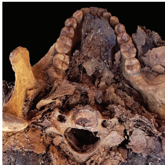
Fig.8. Base of the cranial block preserving the soft tissues, including the tongue.

It preserves the tongue in the oral cavity, eye remnants, and periosteal, epithelial, dermal as well as the muscle ligament tissue, especially at the base of the skull, the facial part, and the spine. 9