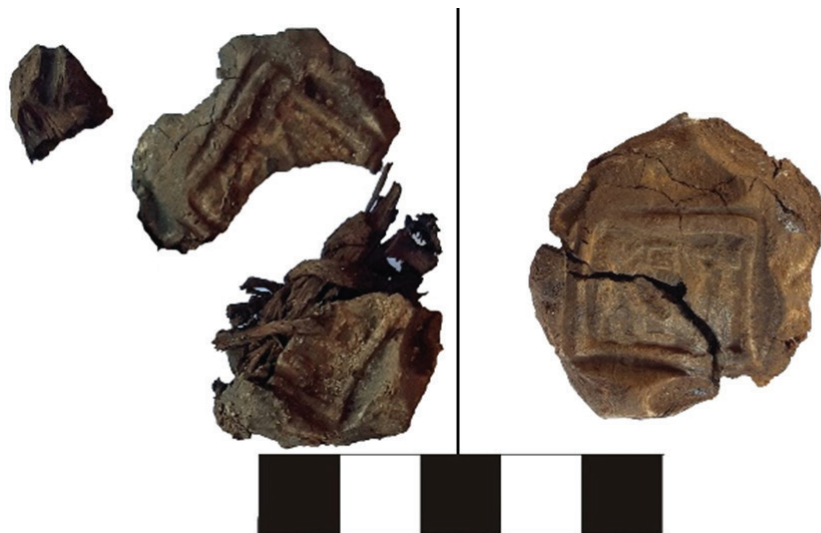
Fig.2. Detail of one of the clay seals found on the individual 36181, before and after its treatment. Oxyrhynchus Archaeological Mission.

The seals discovered in Tomb 42 are made with fine brownish clays. Seal impressions featuring motifs derived from the Egyptian funerary iconographic repertoire were made when the clay was fresh, leaving the drawings in a bas-relief. They are not fired afterwards.