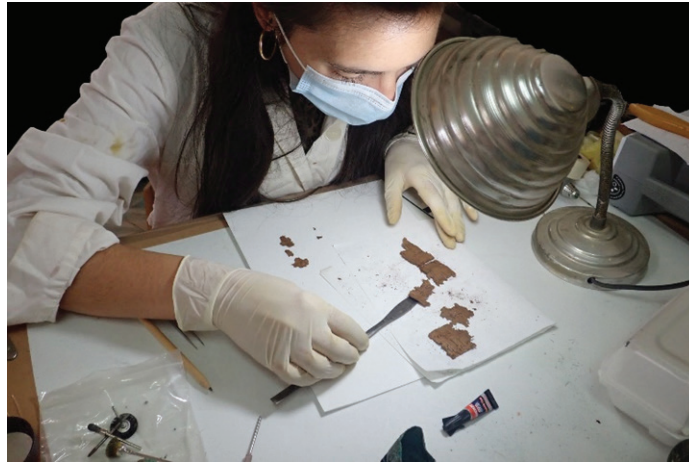
Fig.1. Papyrus consolidation process in the laboratory of the mission. Oxyrhynchus Archaeological Mission.

The main objective was to identify the different papyrological units, clean them as much as possible, document the process and leave the manuscripts in the best possible condition for their storage, conservation, examination, and manipulation for study. The option selected for their storage consisted of placing them between sheets of glass, whose sides were sealed with adhesive tape afterwards.