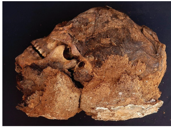
Fig.7. Skull of the young woman 36181, preserving the hair. Oxyrhynchus Archaeological Mission.

It preserves the tongue in the oral cavity, eye remnants, and periosteal, epithelial, dermal as well as the muscle ligament tissue, especially at the base of the skull, the facial part, and the spine. 9