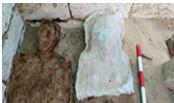
Fig.9. Detail of the excavation and conservation treatments performed on the helmet-mask.

The deceased 36181 was found in association with a richly decorated helmet-mask. The artefacts' features already suggested the gender of the individual, later confirmed by the anthropological study performed on the deceased remains. The state of conservation was extremely poor. The mask displayed many cracks, fissures and lacked constituent material, in addition the pictorial decoration was altered, powdery, and presented numerous losses.