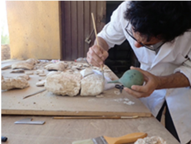
Fig. 6. Cleaning and consolidation process of the plaster mummy-case. Oxyrhynchus Archaeological Mission.

The procedure was the same as that performed in the previous case, even though, being a larger, thicker, and more complete mummy case, it required larger gauzes. Thanks to the initial consolidation tasks and the extraction protocol, the entire mummy case arrived at the laboratory, even though, due to its poor state of preservation, it suffered extensive fragmentation. The work in the laboratory was later continued in the following archaeological campaigns held in 2021 and 2022.