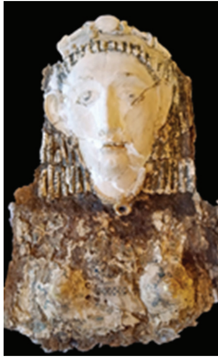
Fig.10. Helmet-mask. Oxyrhynchus Archaeological Mission.