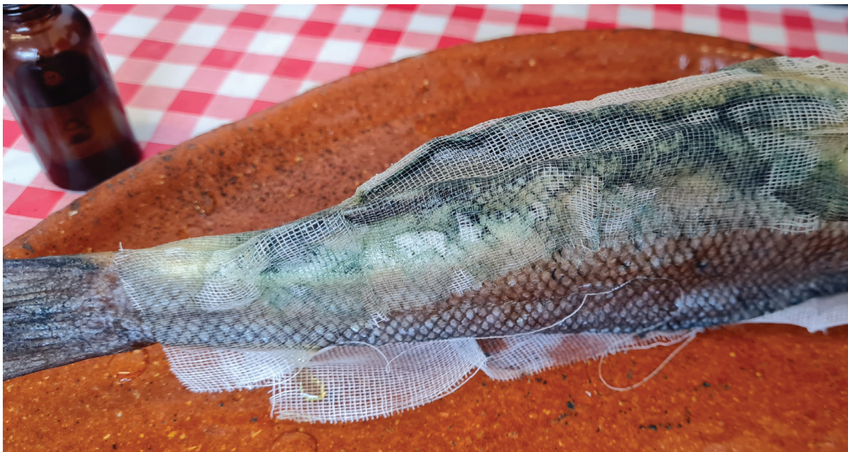
Figure 10. The first wrap is applied with oiled gauze

The first layer of gauze was placed directly on the fish's skin (fig. 10) and adapted to its surface by moistening it with the oil solution. For the following layers, the body was wrapped with different linen strips impregnated with oils.