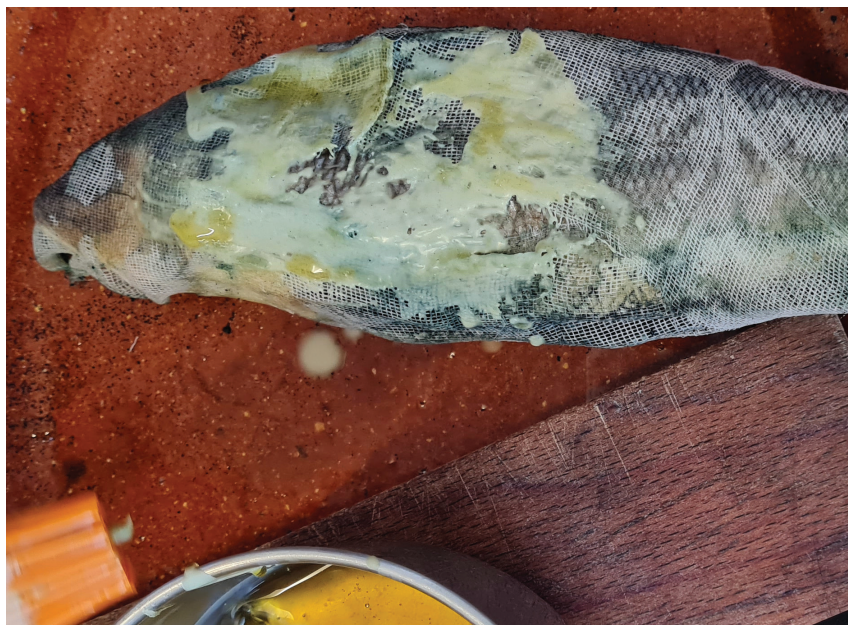
Figure 12. Application of liquid wax on the skin

Having reached the melting point between 62 °C and 65 °C, it becomes a manageable liquid that can be applied to the fish's surface to form a protective layer when it cools (fig. 12).