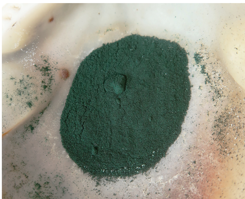
Figure 8. Maxima spirulina algae extract

The textile wrapping has used cotton gauze and strips of linen of various wefts (fig. 9), cut from a wider canvas.