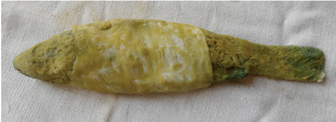
Figure 13. Wrapping with bandages and final presentation

putrefaction. Secondly, the wax helps maintain the structure and shape of the fish in its final appearance (fig. 13).