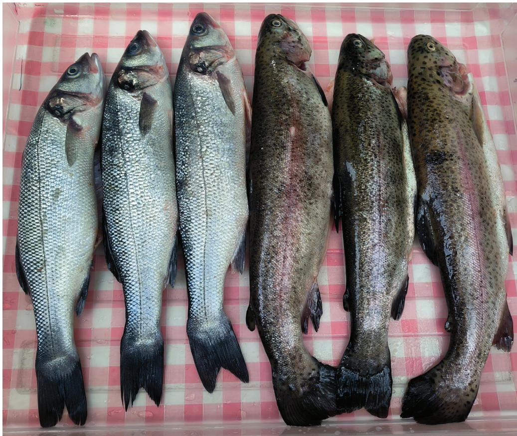
Figure 1. Initial experimental sample

The planned procedure includes these steps: