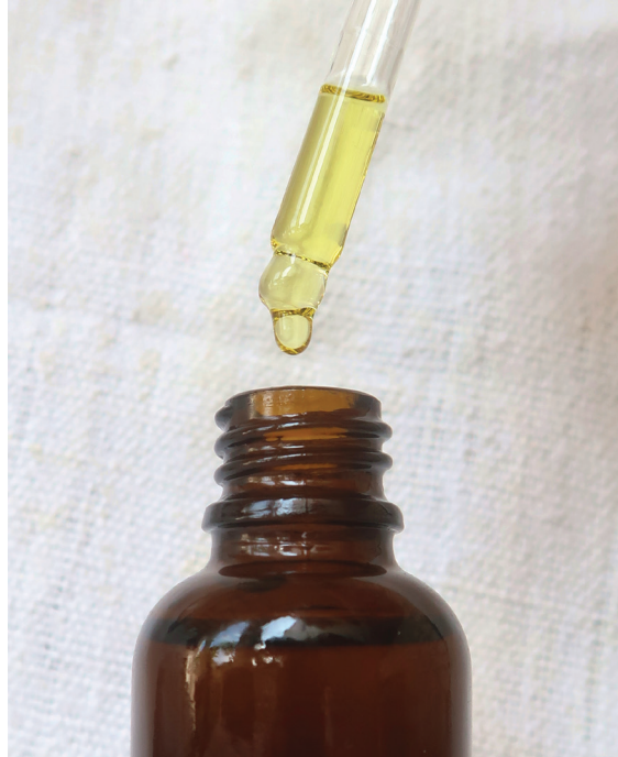
Figure 6. Application of essentials oil mixture

The application of the ointments first causes a pleasant smell that immediately neutralizes the organic smell of salted fish. The massage with the balms practiced on the abdominal tissue makes it flexible and easy to manipulate. This propriety and their antimicrobial effects are documented 9 and implemented in the human bodies' mummification process.