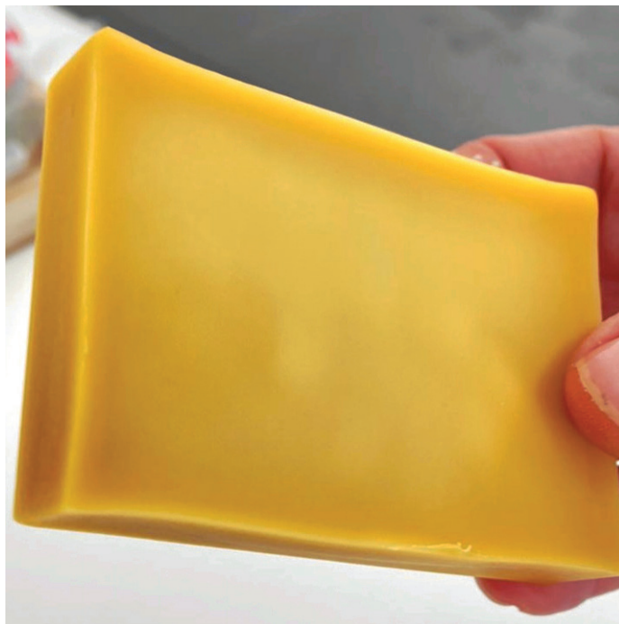
Figure 11. Beeswax tablet

Having reached the melting point between 62 °C and 65 °C, it becomes a manageable liquid that can be applied to the fish's surface to form a protective layer when it cools (fig. 12).