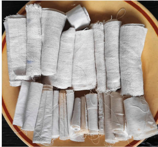
Figure 9. Linen bandages

The first layer of gauze was placed directly on the fish's skin (fig. 10) and adapted to its surface by moistening it with the oil solution. For the following layers, the body was wrapped with different linen strips impregnated with oils.