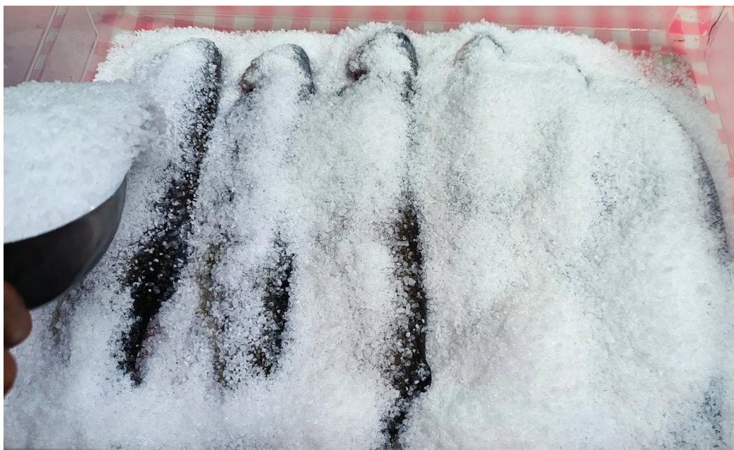
Figure 3. Saline deposit

The only specimen in suitable conditions at the time to the first treatment was specimen number 1 (fig. 4, table 3).