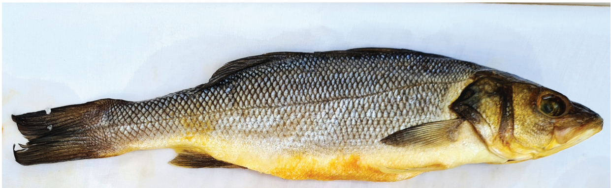
Figure 5. Cleaned fish after vinegar depot

To remove the salt remains after the dehydration process, the selected specimen are immersed in a container with apple cider vinegar for about 30 minutes, ensuring it penetrates the eviscerated abdominal cavity as well. Once cleaned, they are dried with a cloth and left to air dry for twenty-four hours (fig. 5).