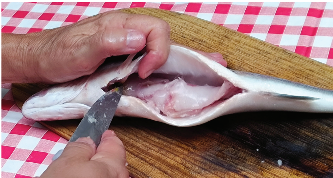
Figure 2. Abdominal evisceration

The intended units are cleaned with a dry cloth to be cut. After making a cut on the ventral surface (fig. 2), the organs are removed and discarded: intestines, liver and stomach.