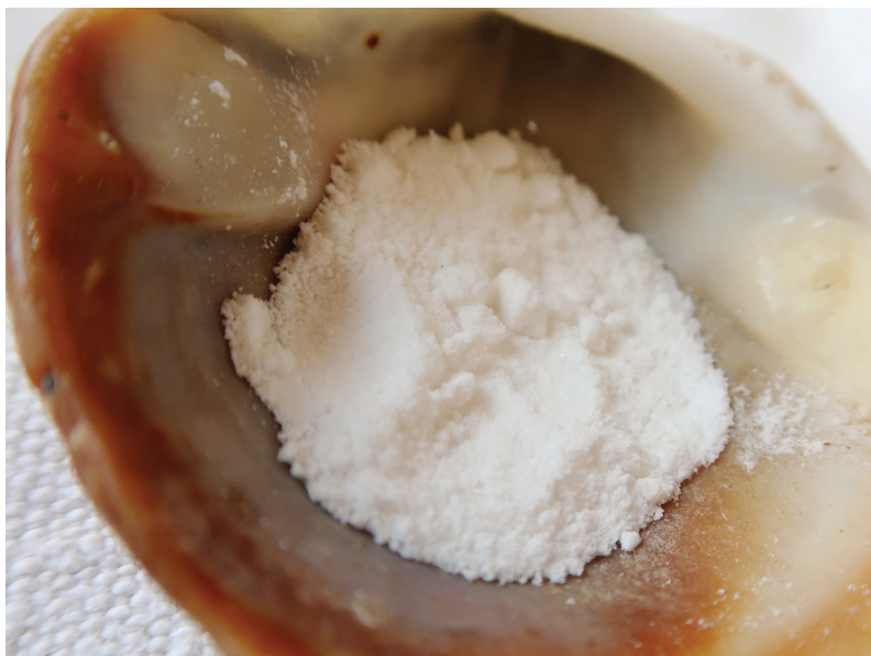
Figure 7. Citric and tartaric acid