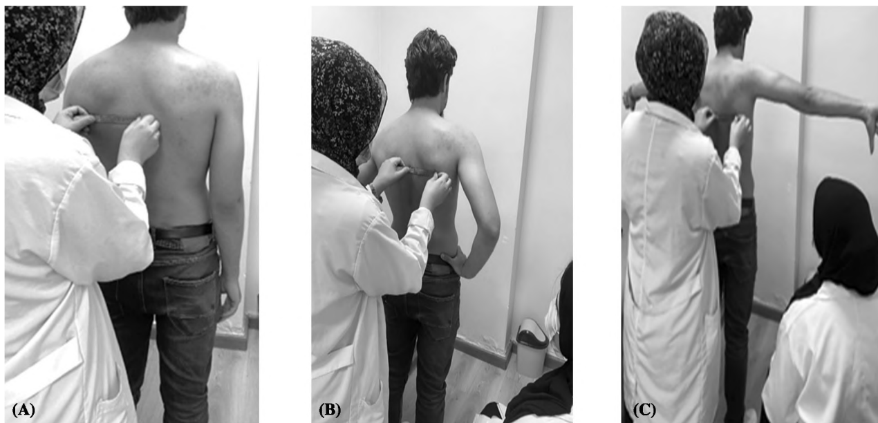
Fig. (1): Lateral Scapular Slide Test. (A) with arms at sides, (B) with hands on the hips, (C) with arms at 90° shoulder abduction and full internal rotation.