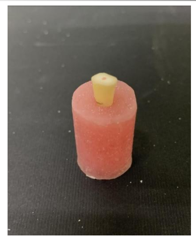
Figure 1. Photograph showing root mounted in self- cure acrylic resin block.

All samples were placed in the lower plate of the testing machine, and a custom- made metal spreader with a diameter of 3 mm was secured in the upper part. The tip was positioned in the center of the canal orifice, and force was applied vertically to the root's long axis at 0.5 mm/min crosshead speed until root fracture. The amount of force required for root fracture was measured in Newtons (N). Figure 2