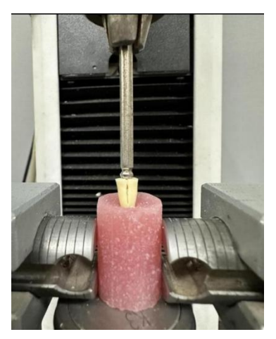
Figure 2. Photograph showing a tooth mounted in acrylic resin after being fractured using universal testing machine.

All samples were placed in the lower plate of the testing machine, and a custom- made metal spreader with a diameter of 3 mm was secured in the upper part. The tip was positioned in the center of the canal orifice, and force was applied vertically to the root's long axis at 0.5 mm/min crosshead speed until root fracture. The amount of force required for root fracture was measured in Newtons (N). Figure 2