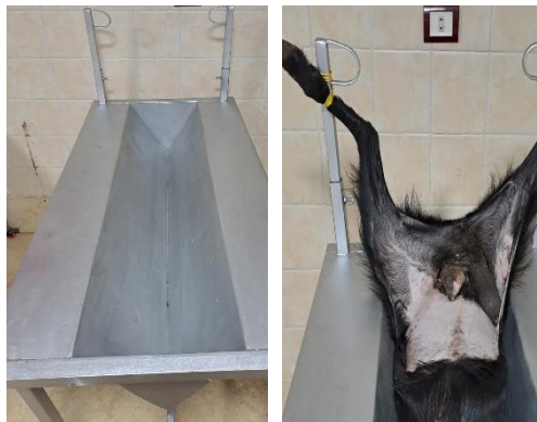
Fig. 1. Special cradle was designed to facilitate the approach of Trendelenburg position