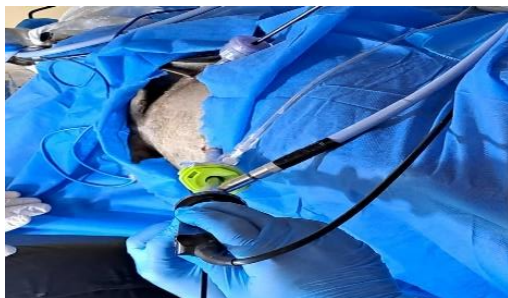
Fig 2: laparoscopic portal site on the goat abdomen. The first portal was located at the trans umbilical region with 10 mm diameter. The other portal was performed 7-10 cm caudal to the first incision in the left para-inguinal region with 5 mm diameter