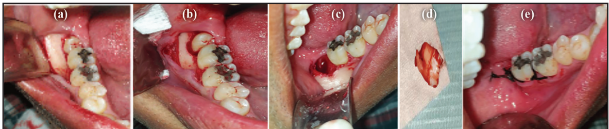
Fig. (1) Surgical procedures; (a) clinical photograph showing reflection of flap to expose impacted tooth and bone around it, (b) clinical photograph after osteotomy, (c) showing socket after extraction of impacted third molar, (d) extracted impacted tooth, and primary wound closure by using interrupted sutures.

All patients were subjected to the following drugs after the surgery Augmentin (1 gm) tablets every 12h for 7 days. Flagyl (Sanofi-Aventis Egypt, under license of Sanofi-Aventis France) is available in 500 mg tablets every 12 h for 7 days. Brufen (Kahira Pharma & Chemical Ind. Co. under license of Abbott Laboratories), 400 mg tablets as required. Hexitol (The Arab Drug Company, Cairo, A.R.E) for 7 days postoperatively. All patients were informed of the expected occurrence of facial swelling, pain, and trismus. A sterile gauze pack was kept on the