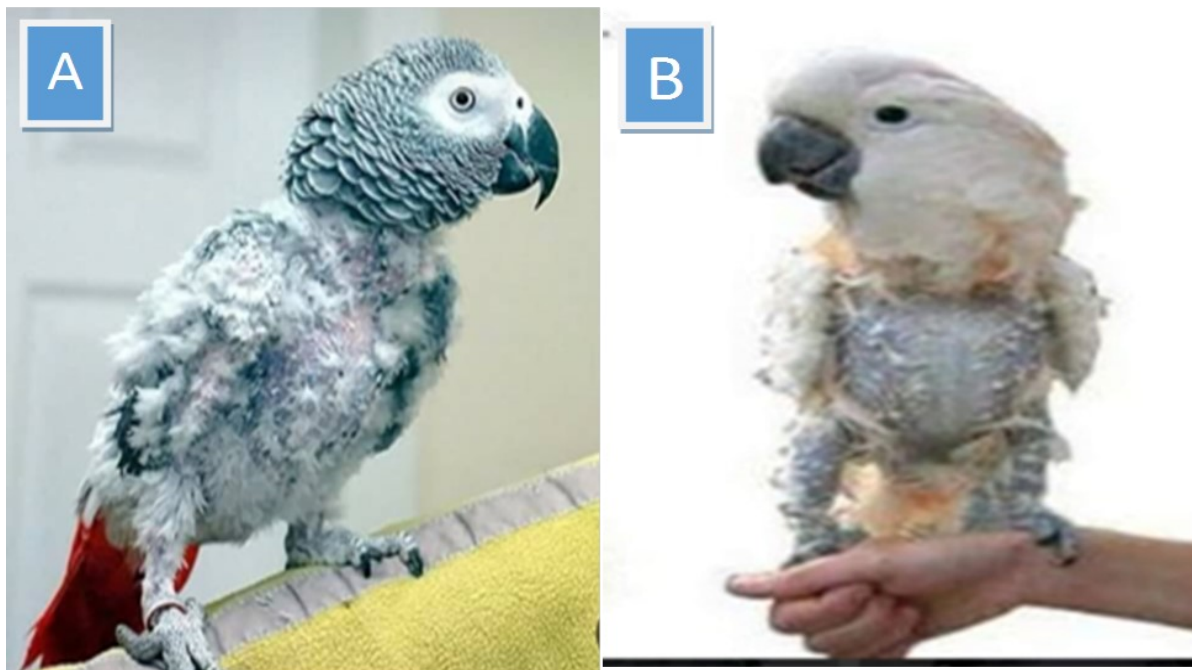
Figure 1: An injury to an African gray parrot is depicted in Picture A, along with the appearance of skin exposed due to the bird's loss of feathers in the chest and wings. Regarding the cockatoo parrot in image B, its legs and chest have completely lost their feathers, leaving only malformed feathers visible

During 2022 and 2023, three hundred forty feather follicles and blood samples were collected from 11 species. Blood samples were collected from the brachial vein and stored in absolute ethanol for molecular analysis. The samples were provided by private breeders. Sixty-four birds that showed clinical signs of PBFD were collected. These symptoms include the bird becoming less active and vibrant, losing and deforming feathers, and developing certain secondary diseases like fungi and bacteria as a result of viral infection Figure (1) . According to Positive PBFD virus Cases, we collected samples from fifty-three birds in contact with diseased cases. And fifty-three birds were collected from healthy cases, Table (1) .