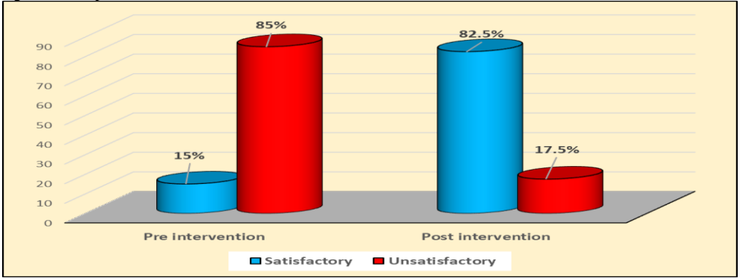
Figure (1): Percentage distribution of the studied nurses according to their total knowledge about caring of vitiligo patients undergoing of photo therapy pre and post implementation of educational nursing guidelines (n=40).

X^{2:} Chi Square Test. FET= Fisher's Exact Test. t= Paired-t test. (**) Highly statistically significant at p < 0.01.